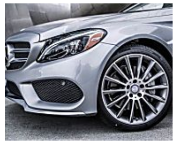
10 New Cars in 2015 That Are Changing the Game