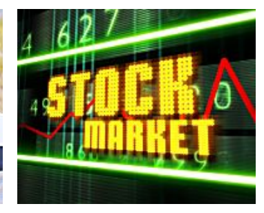
tiny stock with big upside in 2016